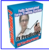
Forex Scalping EA FXPredictor

Buy All our Divergence indicators with Extra Alerts and Hidden Divergence for $990